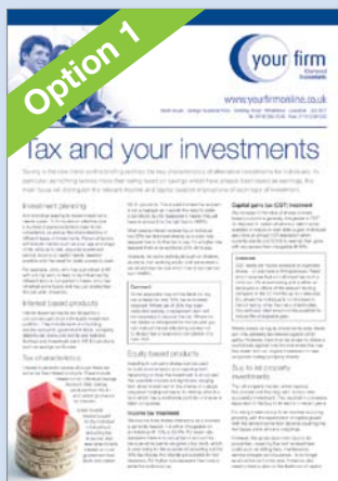
Personalised in one of our standard colours From £90