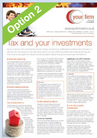
Personalised in your own corporate colours From £115