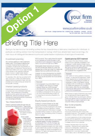
Personalised in black and one of our standard colours From £90