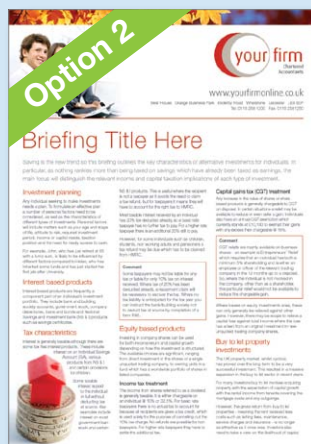
Personalised in your own corporate colours From £115